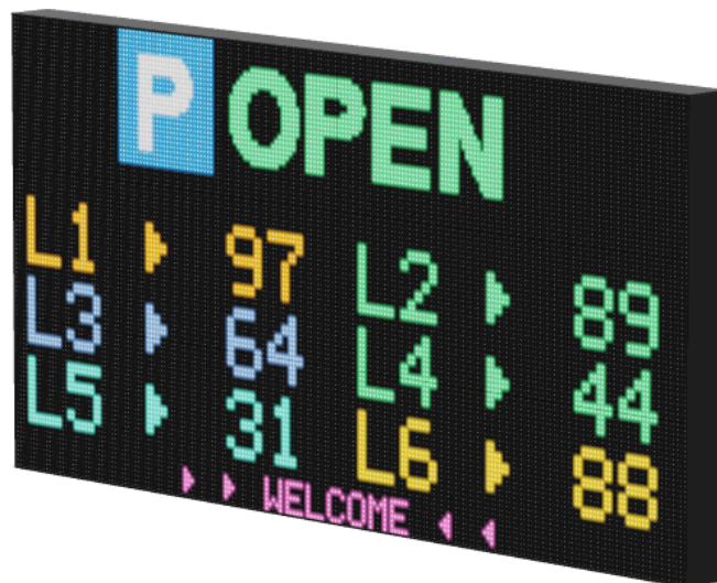
Virtual representation of sign. Actual product may vary slightly.