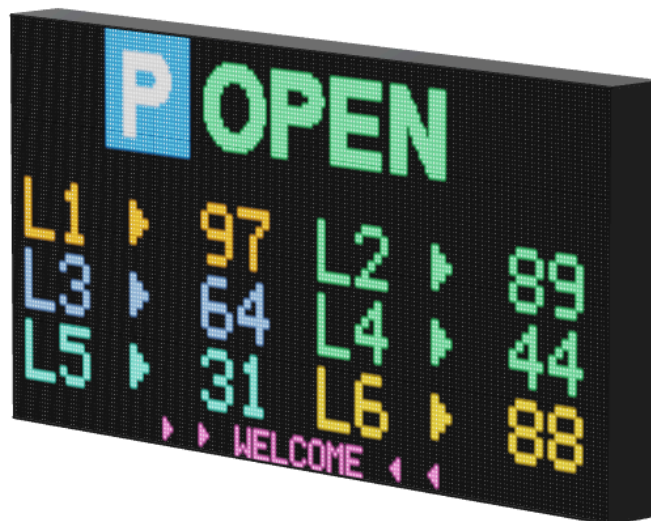
Virtual representation of sign. Actual product may vary slightly.