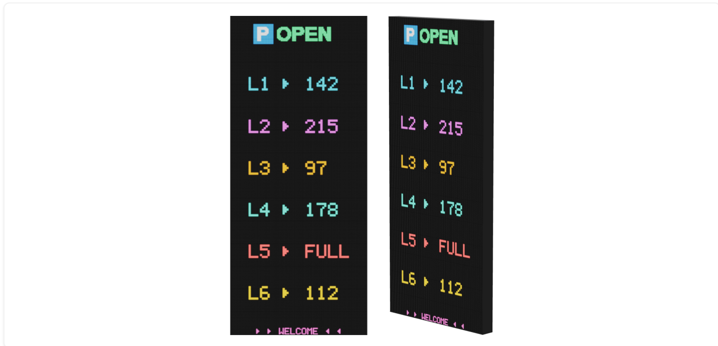
Virtual representation of sign. Actual product may vary slightly.

Outdoor & Indoor Full Color LED Display — 6.67MM Pitch