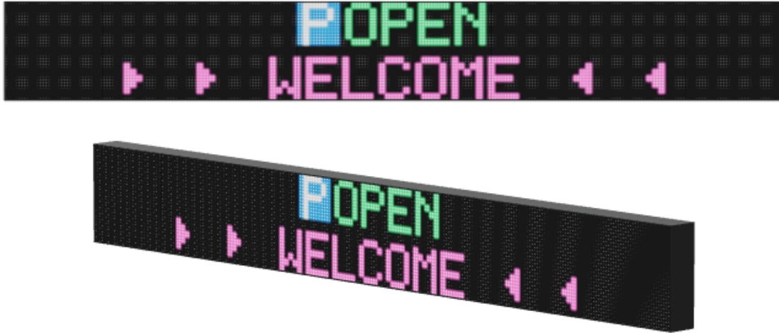
Virtual representation of sign. Actual product may vary slightly.

Outdoor & Indoor Full Color LED Display — 10MM Pitch