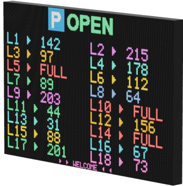
Virtual representation of sign. Actual product may vary slightly.