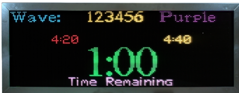
Example of Stainless Steel model